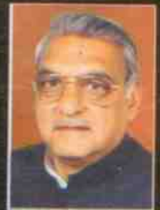
Bhupinder Singh Hooda Chief Minister